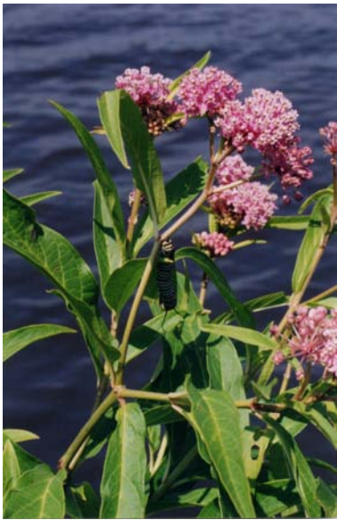
IA, Scott Co., Davenport, Nahant Marsh. January 2, 2002